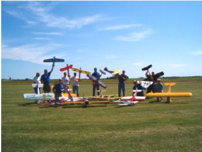
Most of the TCRC pilots at the Park Rapids Fun Fly on Saturday, July 31 st.

About 20 TCRC members and spouses trekked north on Friday, July 30 th for the annual Park Rapids Fun Fly.