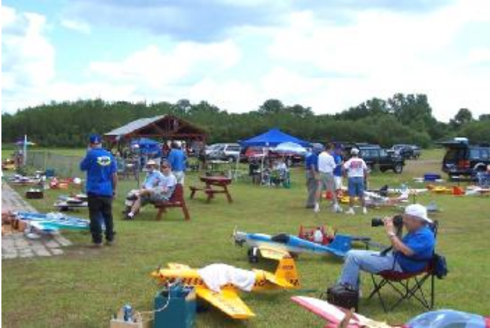
A view of the static display area at TCRC's Model Aviation Day on August 14 th .