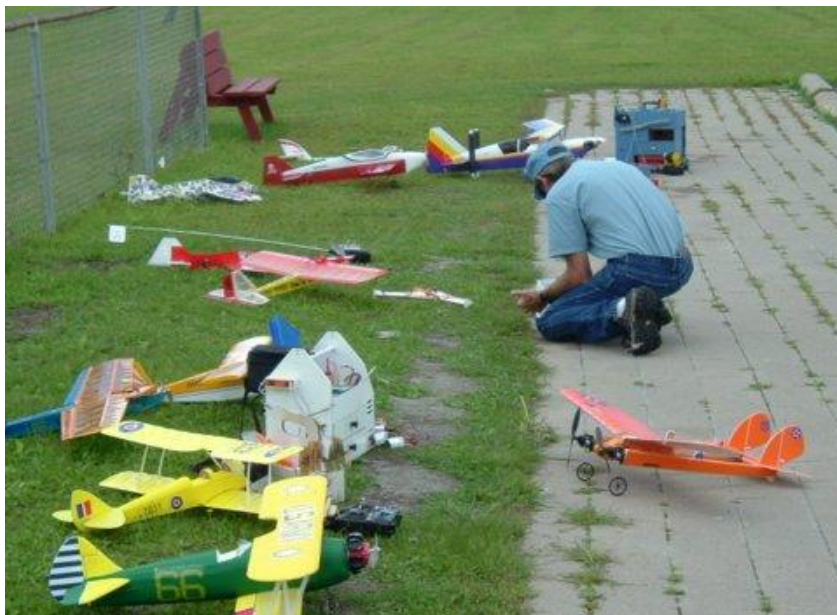
Some of the nice electric planes at the TCRC Electric Fly.