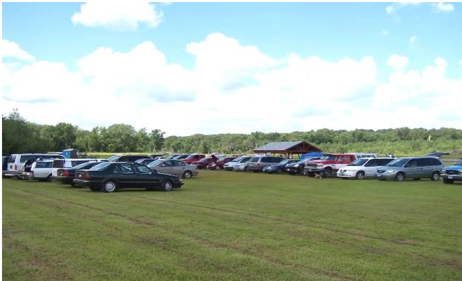
The TCRC Jordan parking lot was packed with cars for the 2004 MAD.

Model Aviation Day was Saturday August 14 th at the Twin City Radio Controllers Model Air Park in Jordan, Minnesota. The weather was perfect (light winds, mid 70's, and light fluffy clouds) for spending the day flying models and talking with model aviation enthusiasts.