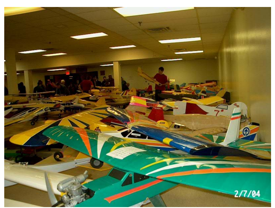
The impound area was full from one end to the other with every kind of R/C airplane imaginable.