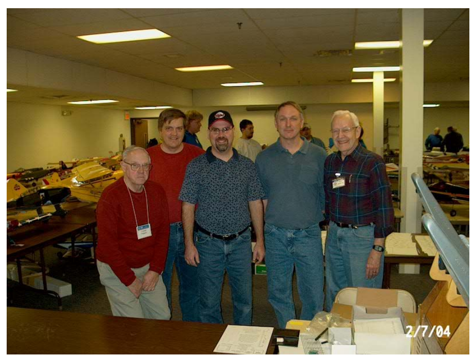
Just a few of the workers in the impound area at the 2004 auction.

By all counts, the annual TCRC Auction was a great success! Overall revenues were on a par with last year, but with a few surprising changes in the revenue allocations. Thanks again to all the volunteers that came out and made this annual event such a success this year. We couldn't do it without you.