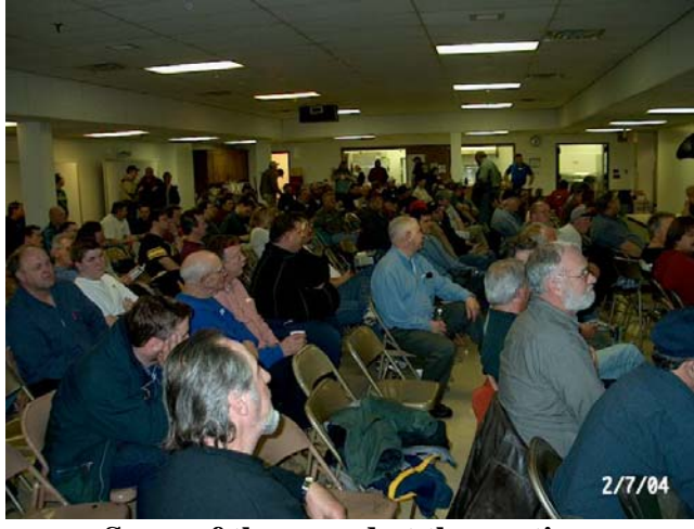
Some of the crowd at the auction.