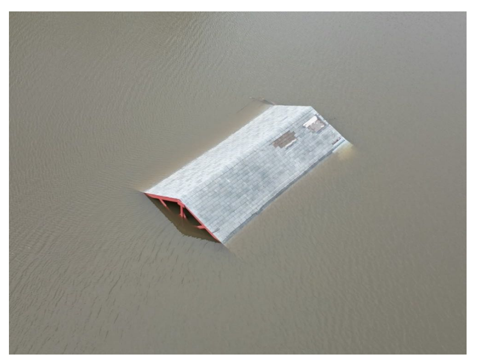
The TCRC shelter barely keeps its roof above water near the crest of the Minnesota River.

The TCRC Flying Field in Jordan was inundated with river flooding for the month of April, with the river cresting at Jordan at 28 feet on April 24th. The Jordan field will start to flood above 18 feet.