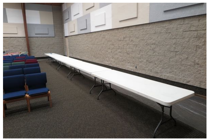
The calm before the storm is obvious as the items coming up for bid haven't yet arrived.