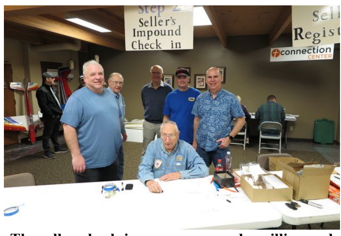
The seller-check-in crew were ready, willing and able to log in all of the aircraft.