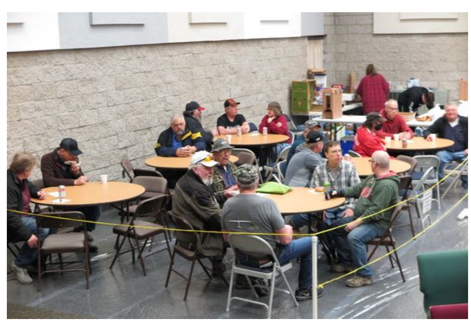
All during the auction the concessions area was busy. Diners could eat, watch the action and even bid.