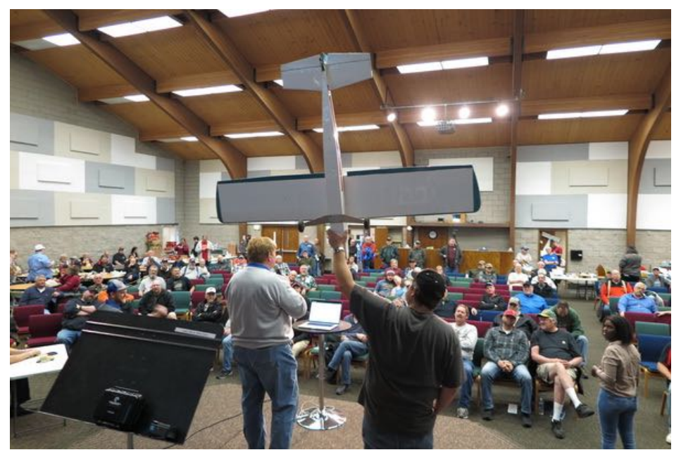
The crowd had a great view of all of the action at the auction.

Saturday, April 30th TCRC held its annual auction for the first time hands of the seller check-in crew. since January, 2020. The 2021 edition had to be cancelled because of This year the club was utilizing a new COVID-19, and then the January 8th date in 2022 was postponed to April, software to eliminate a lot of the again because of COVID issues. With the long hiatus and then the paperwork generated at previous postponement to April the club was concerned that the auction would not auctions. All incoming items for sale be able to attract all of the hobbyists we have done in he past. Well, those were entered into the database as soon fears were quickly put to rest. The 2022 TCRC Annual Auction was a as they crossed the table. huge success!