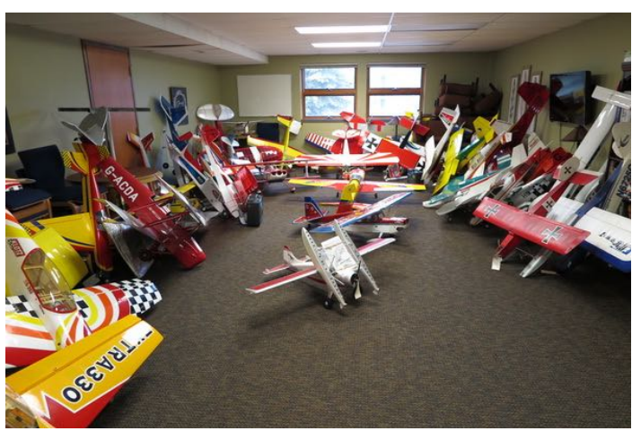
It wasn't just the main impound area that jampacked with airplanes to be sold.