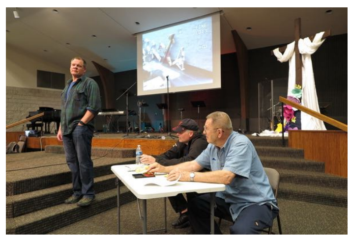
Right after an item was auctioned off it had to be marked and logged by these guys.