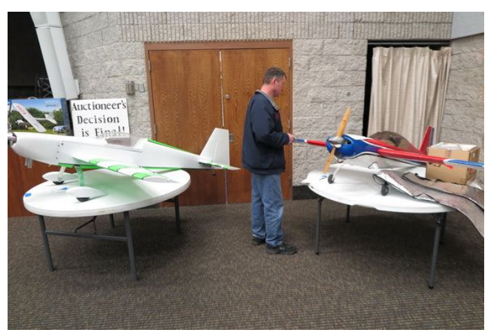
The silent auction area had some really fantastic aircraft for sale during the day.