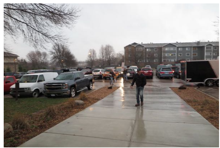
It wasn't snow at the auction in April but it was still a pretty rainy day. Great day for an auction!