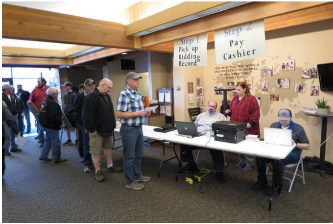
The new software kept the congestion at the buyer check-out to a minimum.