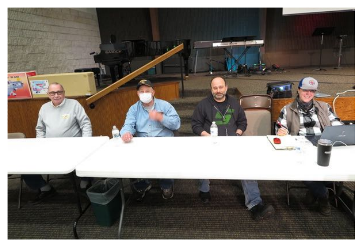
Immediately before an item was sold it was logged in and entered into the computer by this crew.