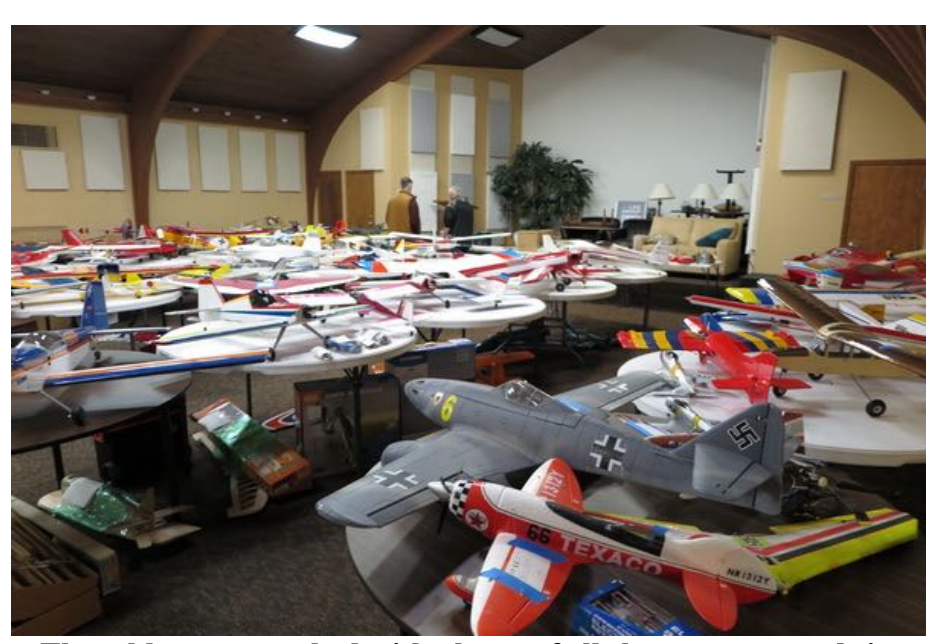
The tables were packed with planes of all shapes, types and sizes. There was something for every buyer.