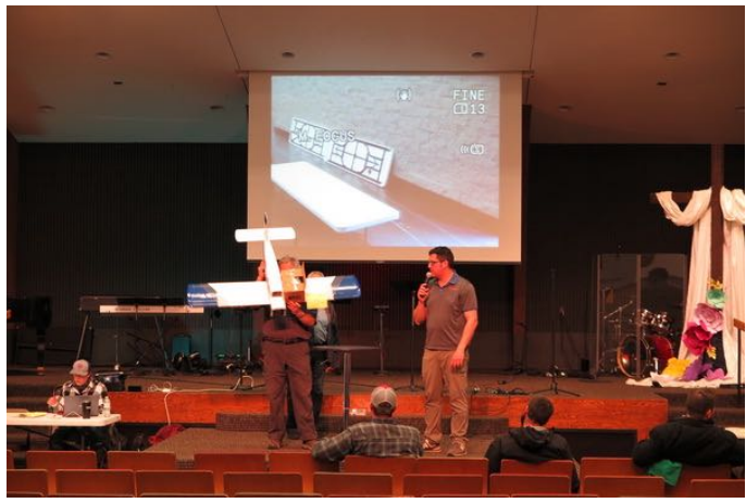
7 hours and 15 minutes after the start the last airplane was sold on the auction block.