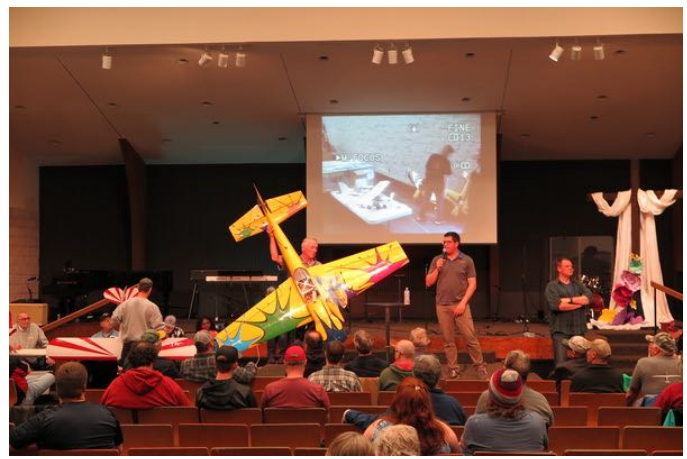
Shareif Eisa did a wonderful job keeping the action fast paced all day.