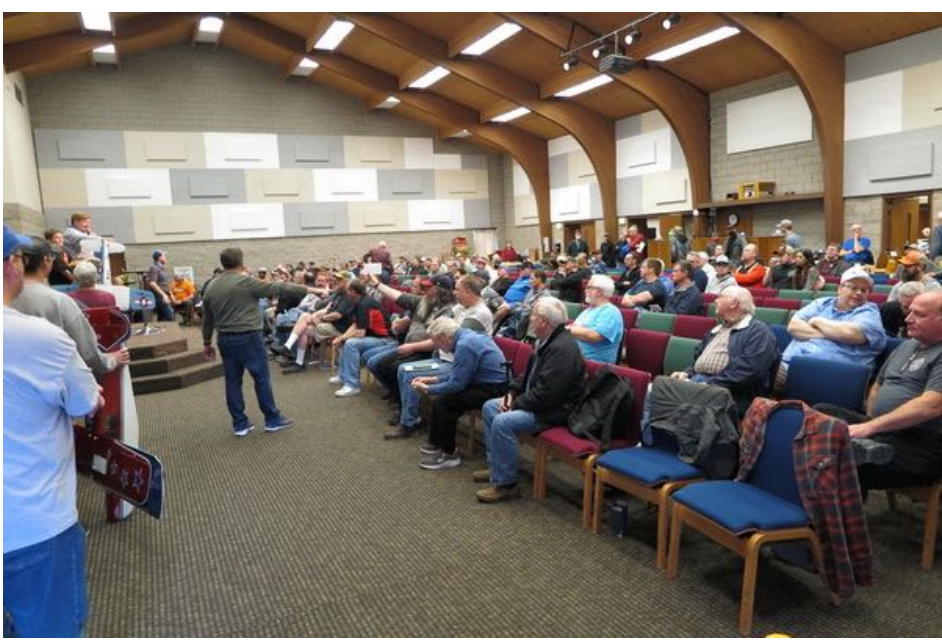
CrossPoint Church is an ideal venue for the TCRC Auction with great visuals and acoustics.