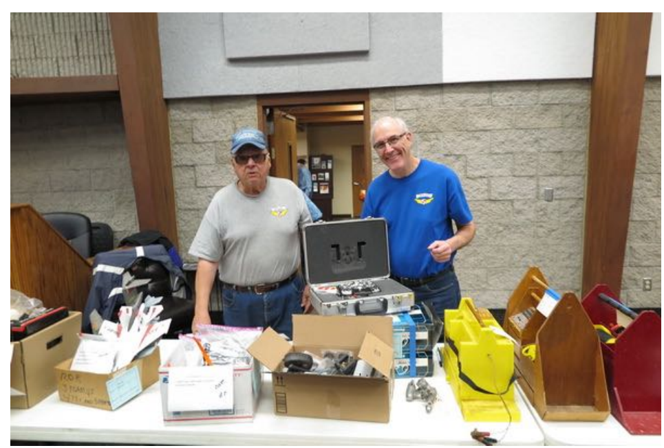
The auction went very smoothly. The Bargain Table was an ideal place to sell smaller items that might not get an opening bid on the auction floor.