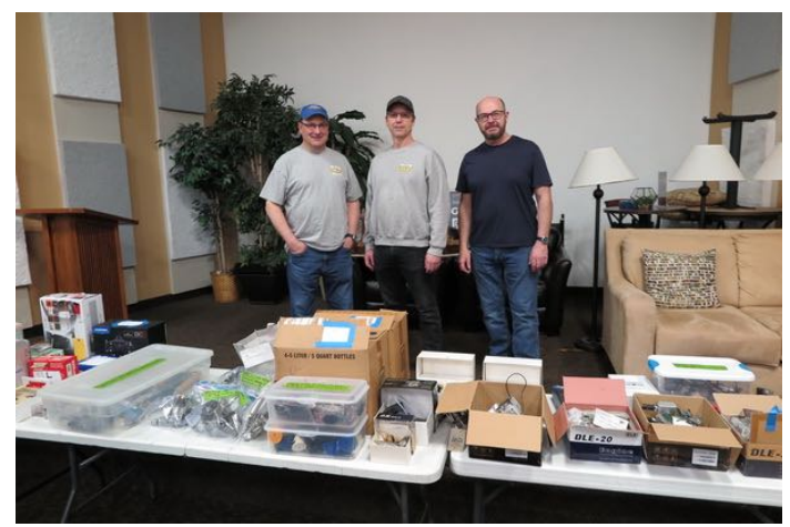
The small-item tables in the impound area were manned by a great crew.