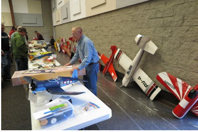
Once the action started the items coming up for bid was a pretty busy place.