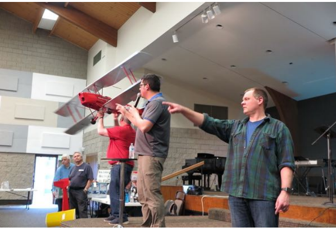
A critical part of keeping the auction moving is the ability of the spotters to see all of the bidding.