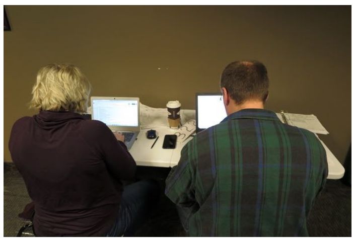
The new auction software gets all of the items for sale entered almost the minute they arrive.