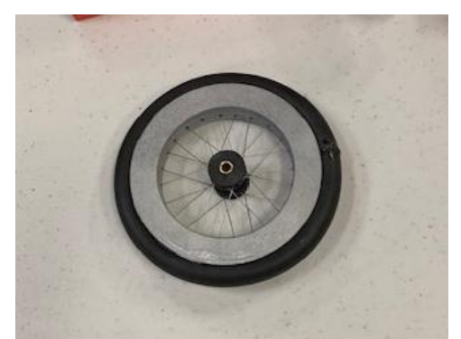
The finished product was a fantastic high quality wheel.