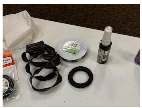
Some of the materials Brian used to construct his wheels.

Brian started with a set of Dubro 2-inch wheels and then using steel wire, dowels, weatherstripping and washers, turned them into fantastic looking wire wheels.