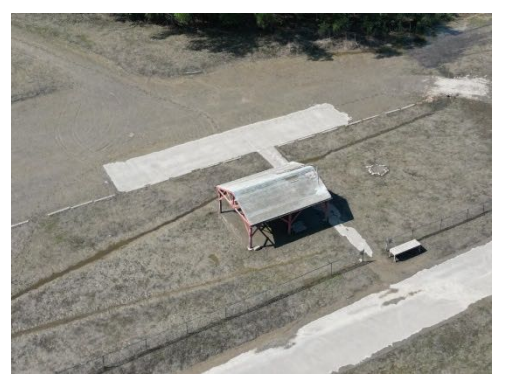
The shelter and paved parking lot strip are free of water.