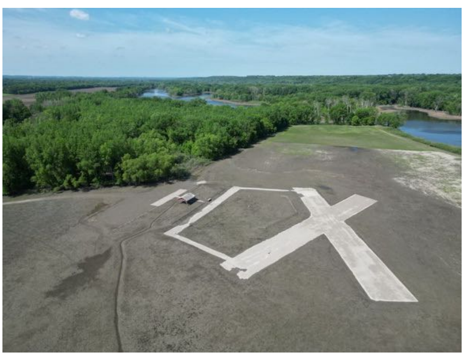
The runways, taxiways, pits, shelter, parking lot and road are free of the Minnesota River.

ON May 28<sup>th</sup>, the Minnesota River finally receded back to 18 feet at Jordan, which is the level at which the TCRC flying site starts to flood. The River had crested more than 12 feet higher than that earlier in the month, but then started a slow but steady decline.