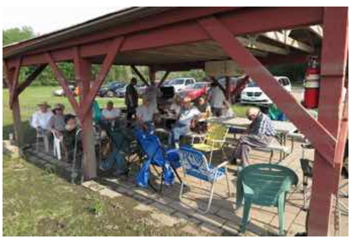
The shelter seemed to be the place to be at the Meeting At The Field.