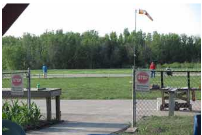
There was plenty of room on the flight line for more pilots to take to the air.