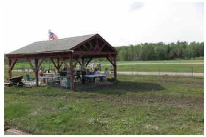
The shelter and the area around it were looking pretty good following the May flooding.