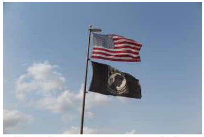
The wind made its presence know at the June Meeting At The Field.