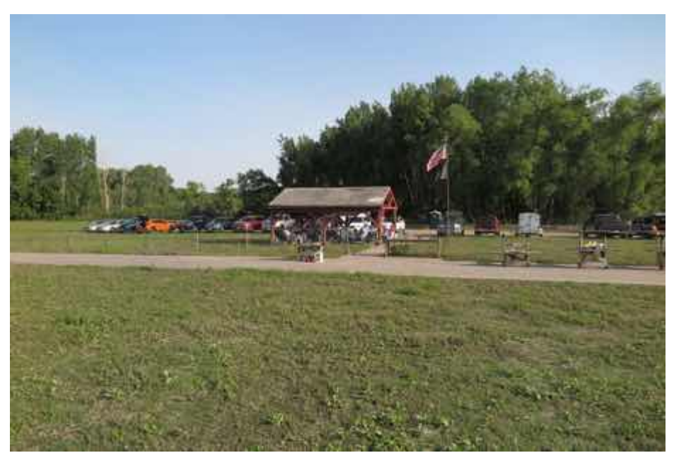
The runways, pits, taxiways and infield were in pretty good shape on June 14th for the Meeting At The Field.

At the end of May, the TCRC Jordan Flying Field was underwater and him out to the flight line. His one it didn't look good for June flying. But the Minnesota River raced off of flight was a very very long one and the area extremely quickly and allowed the club to schedule its June lasted until the dinner bell rang. membership meeting at the field after all.