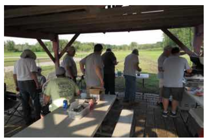
The chow line had plenty of food to let everyone go through a couple of times.