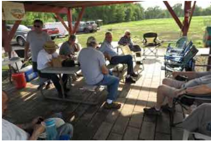
Most of the pilots chose to let the wind blow as they relaxed in the shelter at the meeting.