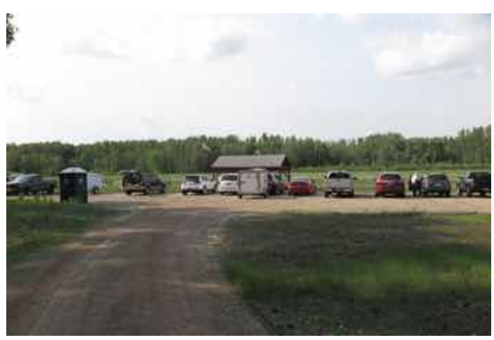
Not only were the runways in good shape, so were the road and parking lot.