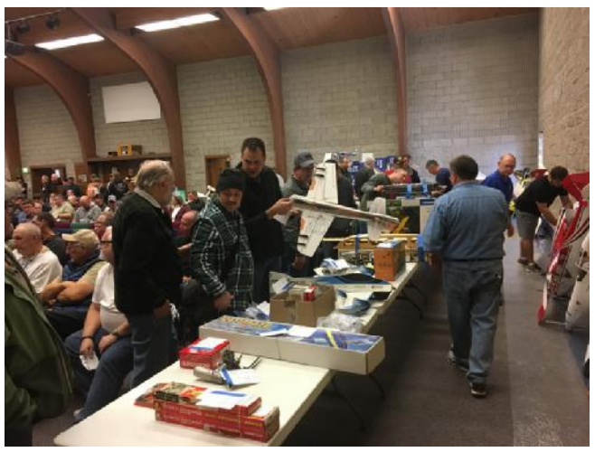
The staging area for upcoming items made it easy for prospective buyers to inspect the planes.