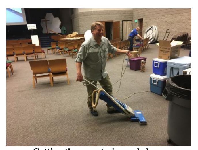
Getting the carpet nice and clean.