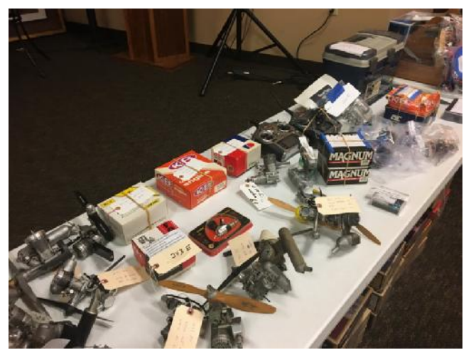
There were lots of engines for sale at the auction and they got decent prices from the bidders.