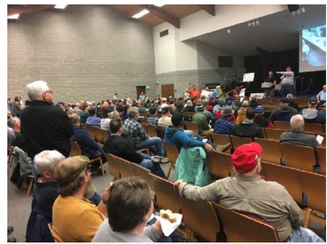
CrossPoint Church is a wonderful place for TCRC to hold the auction.