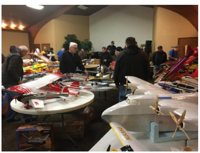
Buyers loved it when they could enter the impound area for some close inspection.