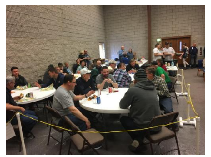
The concession area was a busy place.