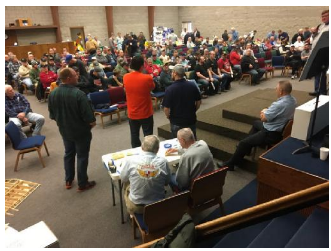
Some of the crowd at the auction.