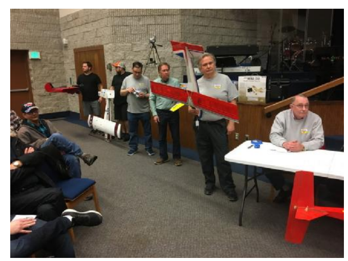
The impound runners who brought planes to and from the auction block kept things flowing.