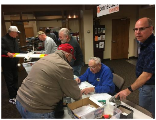
Seller check-in went smoothly and was helped by the good amount of pre-registration.