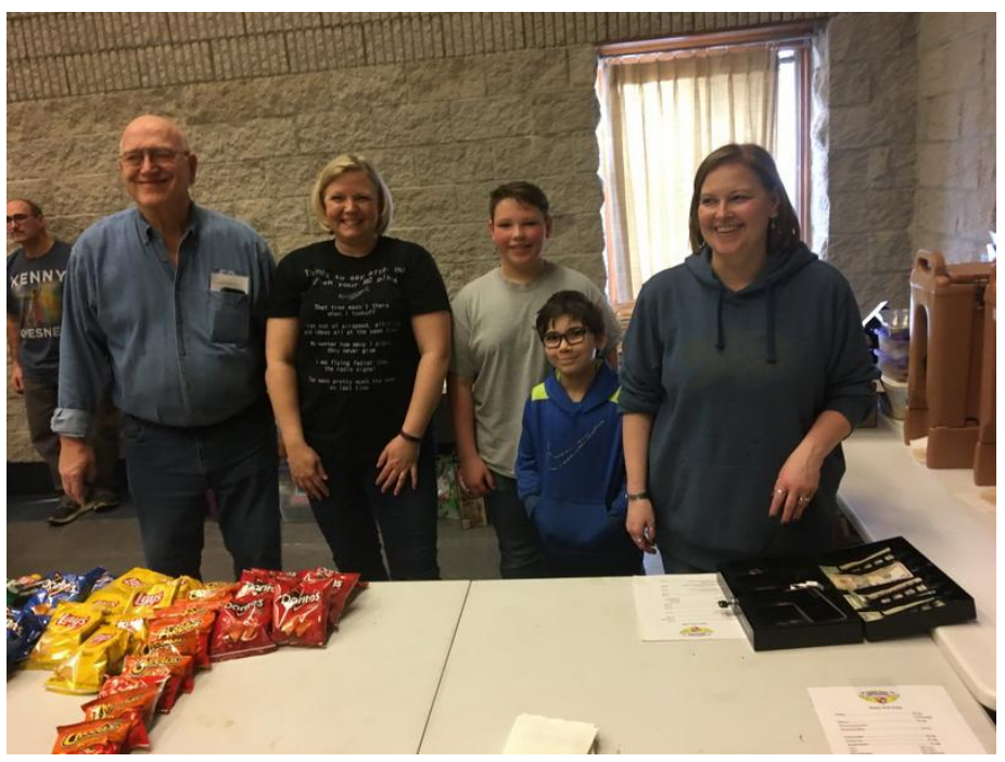
procedures for the auction action, and then the first item went up for the concession area all during the auction.