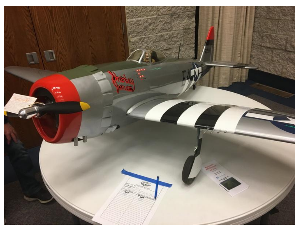
This great-looking P-47 was one of the items that sold during the silent auction. Bidding was brisk.