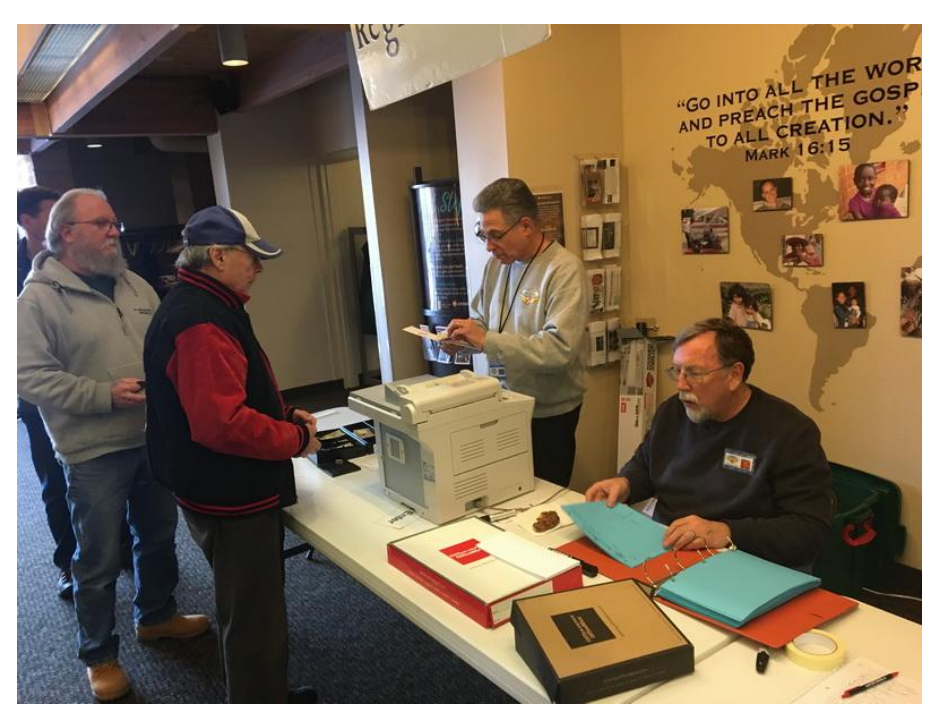
The veterans manning the Admission and Bidder Check-In were a well-oiled machine.