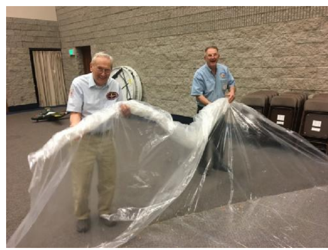
Clean-Up is a big project after the auction ends.