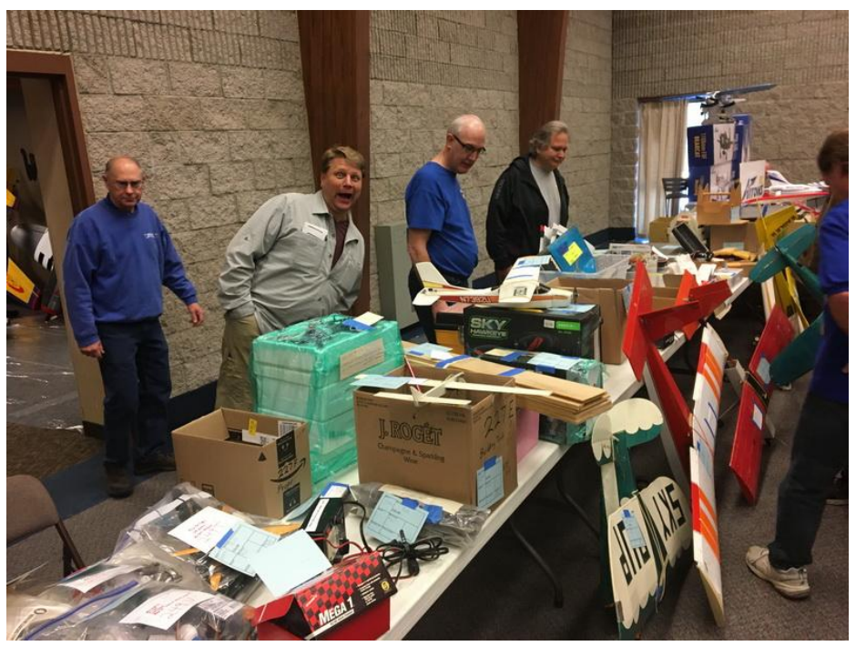
The Bargain Table moved a lot of items, helping to keep the auction to end a little early than estimated.