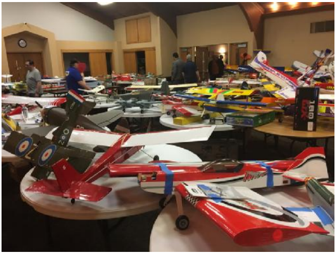
There were planes to be sold everywhere in three different impound rooms at the auction.