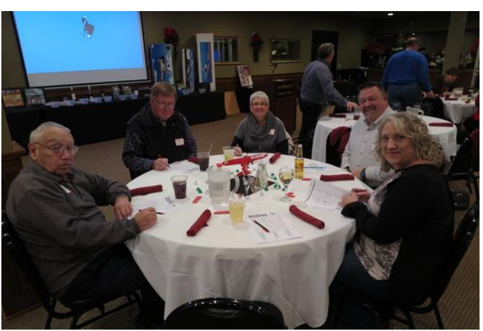
Everyone had a front row seat for all of the events occurring at the Banquet.