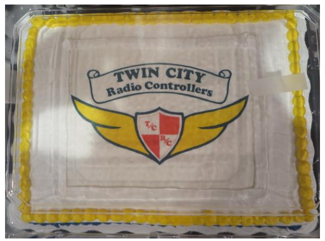
Dessert at the Banquet was the TCRC cake and it tasted even better than it looked.