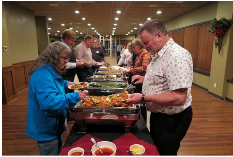
The cuisine at David Fong's Restaurant is fantastic and nobody goes home hungry from the great buffet.

Saturday, November 16<sup>th</sup> found a lot of TCRC members, spouses and family at David Fong's Restaurant in Prior Lake for the TCRC Annual Banquet.