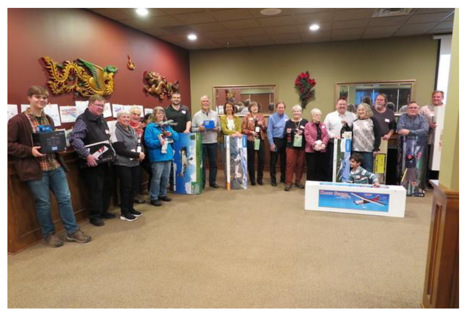
The many, many prize winners at the TCRC banquet pose with their winnings.