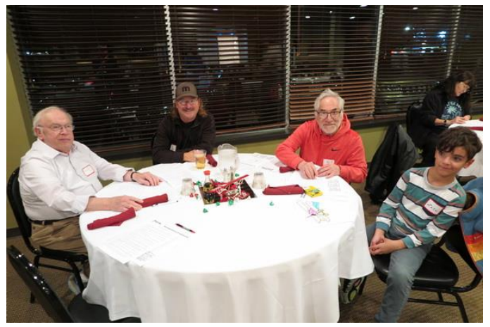
The TCRC Banquet is not only for the older members, but also for the younger ones.