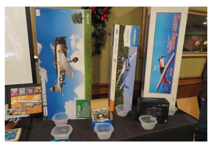
The airplane kits used for raffle prizes were top notch. These were only a few of them.