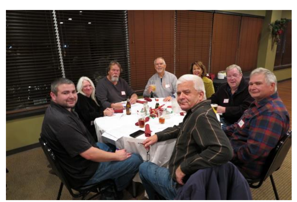
Each table at the banquet became a contestant in TCRC Jeopardy and getting a question correct resulted in many raffle tickets for each person.