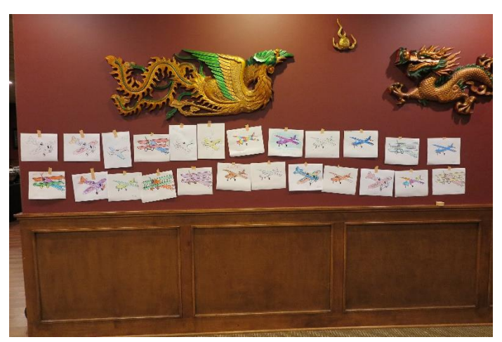
There were lots of entries into the Coloring Contest, making the selection of a winner hard.