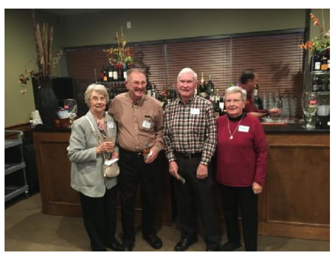
Cocktails were available for the early arrivals at the banquet at Fong's.