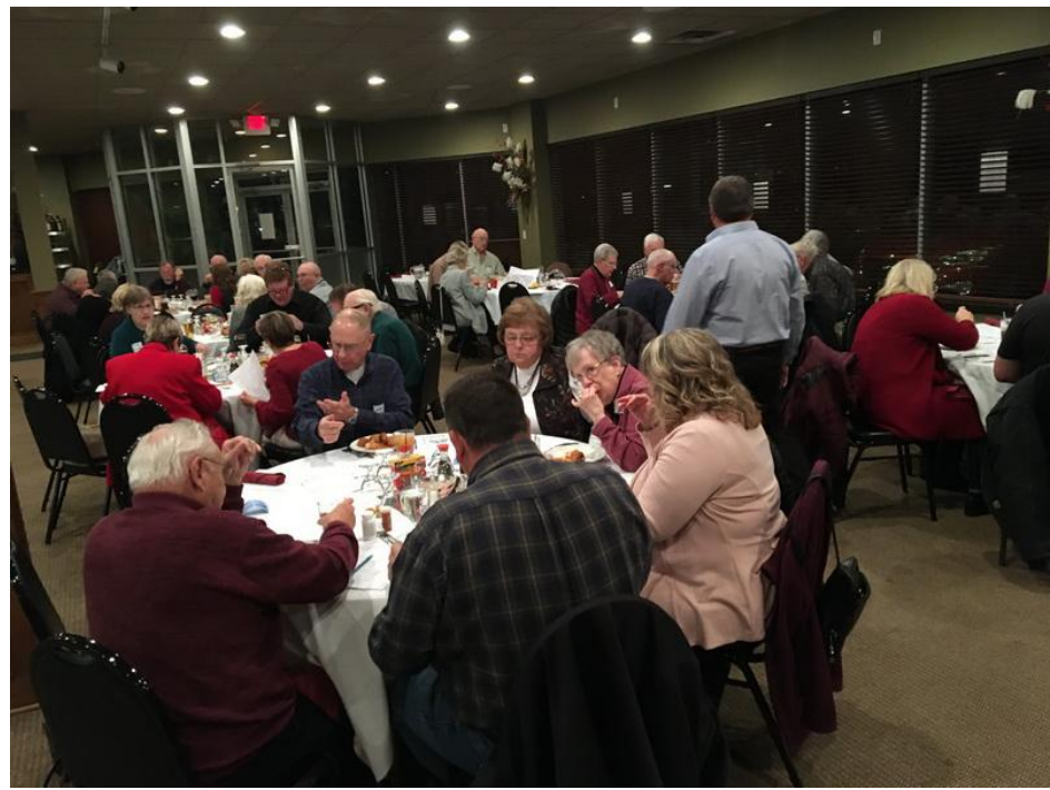
Besides great food, Fong's is very spacious and allows lots of fun activities at the banquet.