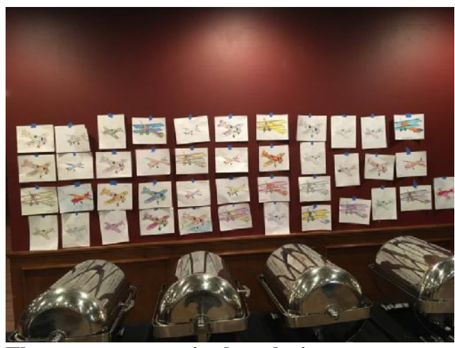
The many entrants in the coloring contest were everyone a work of art!