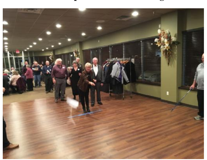
The paper airplane toss had the contestants lining up to see their designs fly or fail.