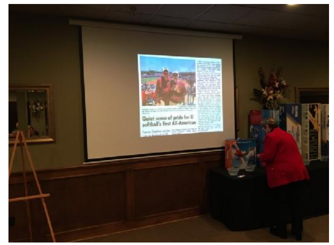
The backdrop at the banquet had a continuous slide show of pictures taken during 2019.