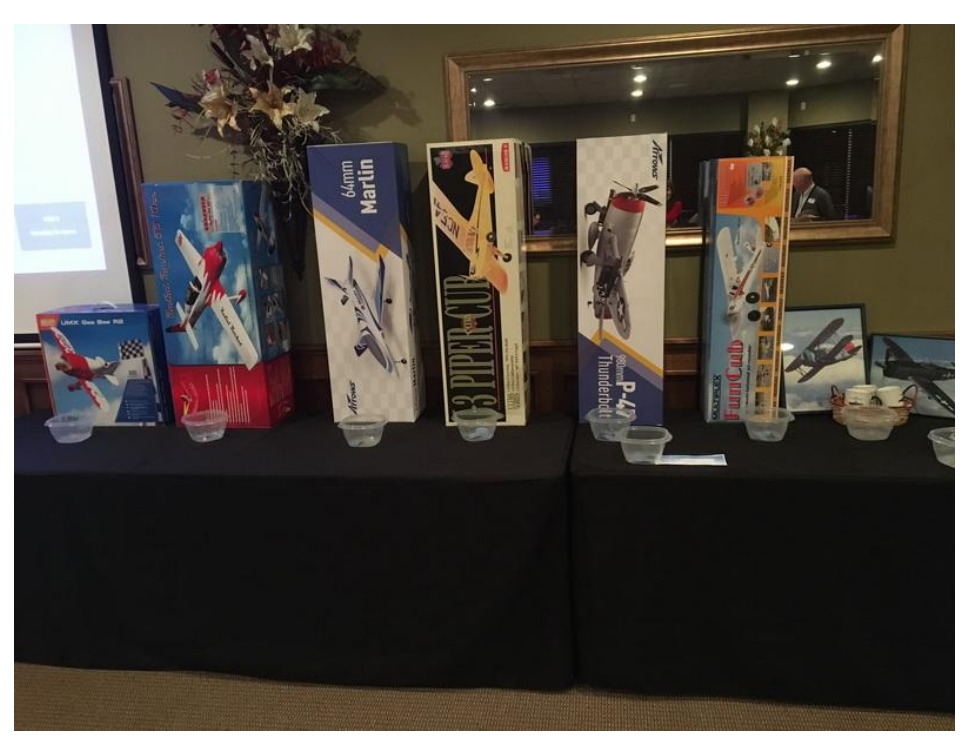
There were six nice ARF airplanes for prizes, but also lots of other neat things to be won at the raffle.