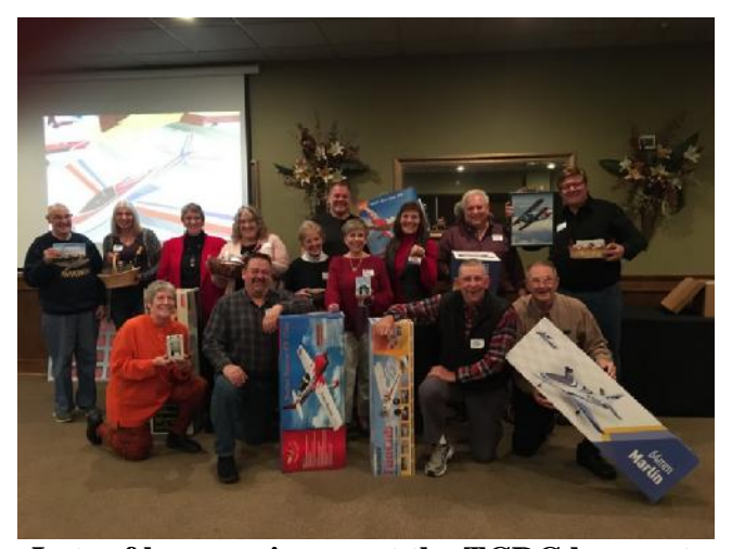
Lots of happy winners at the TCRC banquet.