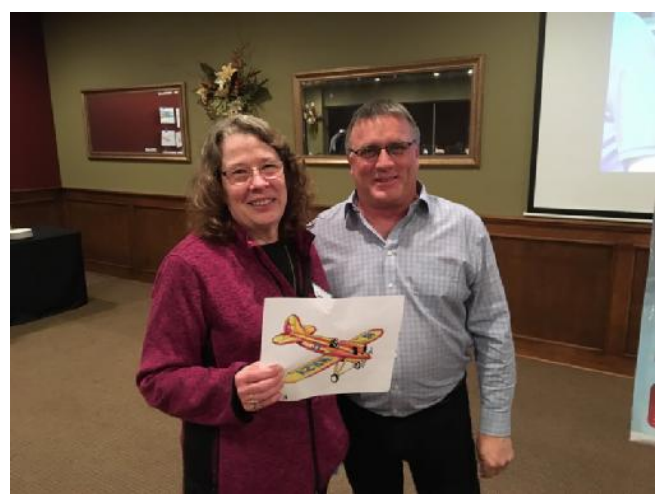
They were all works of art but the winner in the coloring contest was a masterpiece.