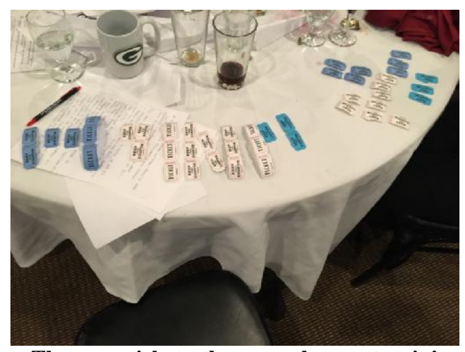
The more tickets, the more chances to win!