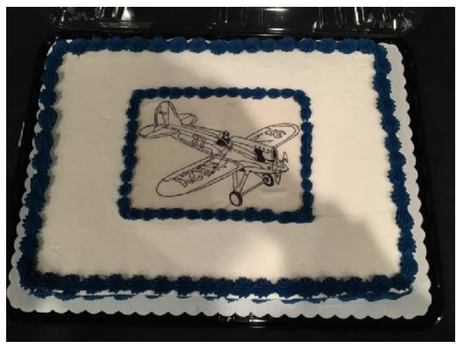
TCRC cake made a great dessert.