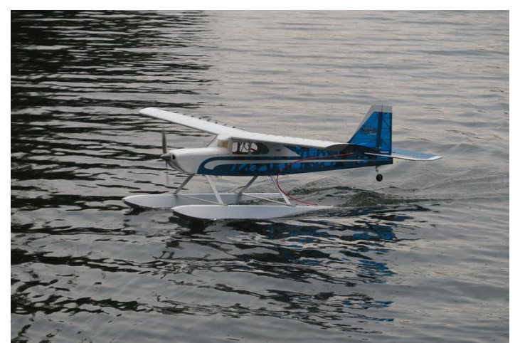
Bill Sachs' great looking plane taxis home after a great flight over Viola Lake in Siren, Wisconsin.