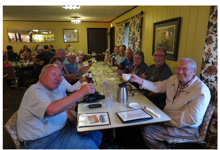
Dinner at Cousin's Hideaway in Haugen.