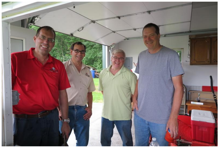
When the rains came down, the RLMAC's clubhouse proved a great place to settle in and weather the storm.