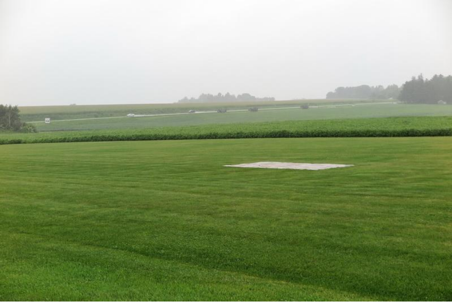
This photo shows the huge open spaces around the manicured runway at the hungry Hollow flying site.